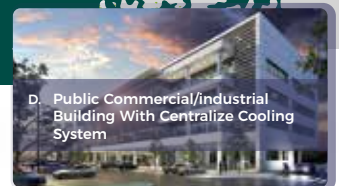
D. Public Commercial/Industrial Building With Centralize Cooling System

Office Building, School, Factories, Warehouse, Workshops, Hangers, Small Office Virtual Office (SOVO), Religious Buildings, Stadiums, Community Halls, Hospitals, Airports, Universities, Colleges, Police Stations, etc