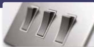
BASIC M&E FITTINGS