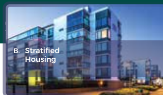
B. Stratified Housing

Detached, Semi-detached, Terrace and Cluster Houses.