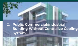
C. Public Commercial/Industrial Building Without Centralize Cooling System

Flat, Apartments, Condominium, Service Apartment, Small Office Home Office (SOHO) and Town Houses